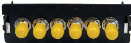
6 Port ST Adaptor Plate