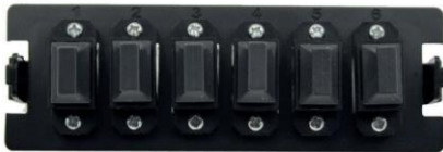
6 Port MPO Adaptor Plate

OS2 (Blue) LC fibre adaptor plates available in either 12F Duplex or 24F Duplex configurations