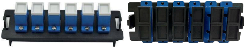
6 Port SC SX Adaptor Plate (L) 6 Port SC DX Adaptor Plate (R)