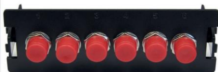
6 Port FC Adaptor Plate