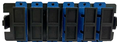
6 Port SC SX Adaptor Plate (L) 6 Port SC DX Adaptor Plate (R)