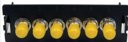
6 Port ST Adaptor Plate