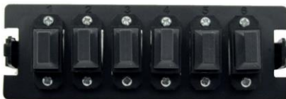
6 Port MPO Adaptor Plate

OS2 (Blue) LC fibre adaptor plates available in either 12F Duplex or 24F Duplex configurations